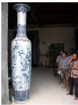
Large pot factory in Jingdezhen