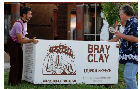
1,000 pound Bray clay box at Brickyard Bash 2008