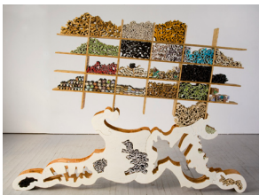
Nathan Craven, Cabinet 2

has produced nearly 10,000 extruded ceramic units. Through the act of arranging, stacking, balancing and connecting the porous ceramic units, he invites the viewer to experience how a wall or floor might contain space and direct flow through space in new ways. Craven states, "In my work, extruded forms function both as decoration and as structure. Depending on their context, they become floors, windows screens and room dividers. This architecture is not merely decorated; it actually grows from decoration."