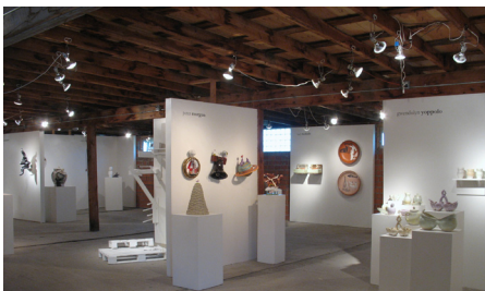
2008 Resident Artist Exhibition, Warehouse Gallery

The Warehouse Gallery was full of artwork in June and July, showcasing the work of the Resident Scholarship Benefit Auction and the annual Resident Artist Exhibition which featured artwork by our 10 long-term residents and our 10 summer residents.