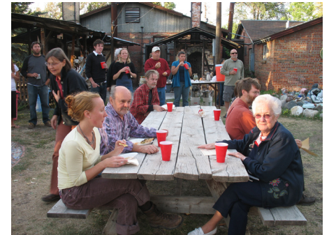
2008 Volunteer Appreciation Party

With all the exciting happenings at the Bray, we could not get it all done without our dedicated volunteers. Thank you to everyone who donated their time and talents to keep the Bray the way it is. We hope we haven't missed anyone, we appreciate all of our volunteers and are so thankful for their help. Thank you! Thank you! Thank you!