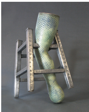
Trey Hill, All In , 2008