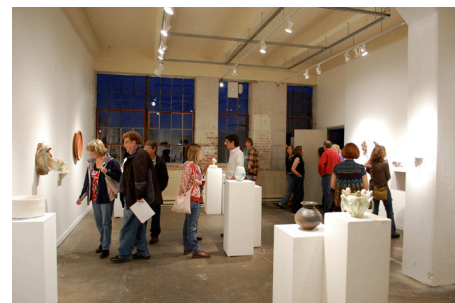
Exhibition at the Kolva-Sullivan Gallery, October 2008