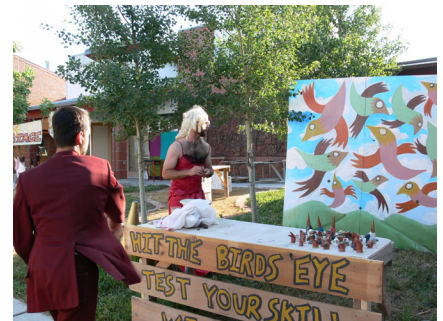
Hit the Bird's Eye booth, 2008 Brickyard Bash