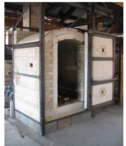
New salt kiln

In May, Donovan Palmquist taught a kiln-building workshop that brought a brand new salt kiln to the Bray. A special thanks to Palmquist and the hard-working workshop participants. The new salt kiln not only provides a needed improvement to the kiln facility, but also significantly reduces natural gas consumption in comparison to the old salt kiln.