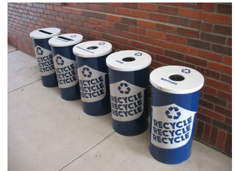
New recycling containers

In an effort to reduce the carbon footprint of the organization, the Bray recently made improvements to its campus-wide recycling program. The Bray will work with local Helena recycling organizations to collect all of the glass, aluminum, paper, cardboard and plastics used on site. In addition to the recycling efforts, the Bray has instituted a composting system that breaks down the raw foods from the kitchen to be used as compost in the community gardens. This has reduced the overall waste in the kitchen while providing nutrients for the vegetable and flower gardens. These steps continue our commitment toward making the Bray a more earth-friendly place.