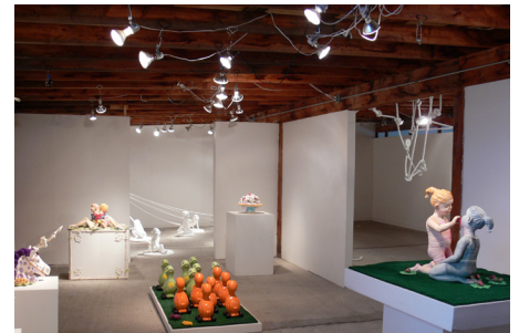
2007–2008 Fellowship Exhibition