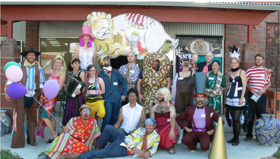
Residents in circus attire, 2008 Brickyard Bash

Registration begins January 7, 2009. For more information go to our Web site at www.archiebray.org Sorry no early registration.